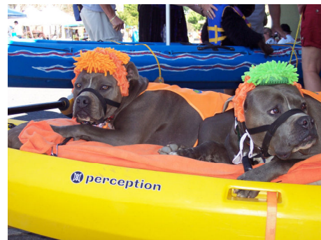
2010 'Best Style' Kayak on Wheels

Our aim is for this event to become self-supporting, but to reach that goal this year we need $6,000-$8,000 in sponsorships toward the ~$15,000 total cost (very inexpensive for an event of this scale). Based on past results, reviews, guest comments and our adjustments this year we're confident that Art & Wine Fusion can reach that goal, and continues on its path to becoming an iconic Gorge event. You need to be a part of this!